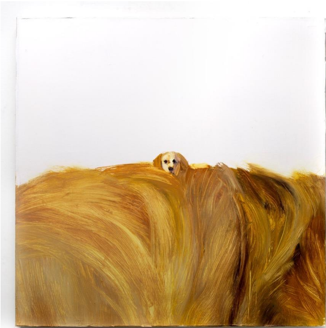
James J.A. Mercer Come Closer 2022 Oil on canvas 26 x 26 in / 66 x 66 cm $3,000.00