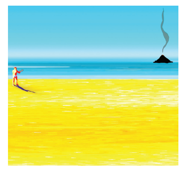
June 8 - July 6, 2024

Meliksetian | Briggs is pleased to present Mirror , Mirror , a two-person exhibition of works by Yifan Jiang and James J.A. Mercer . The show features paintings by each of the artists alongside a collaborative video installation.