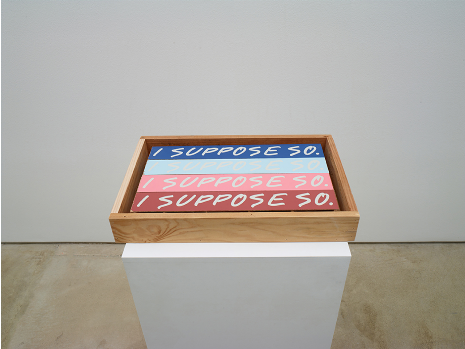
Meg Cranston & John Baldessari Remnants of Fucked Up Paintings (I Suppose So), 2016 Acrylic and oil on wood panel, wood box 16 x 22 3/4 x 5 1/2 / 40.6 x 57.8 x 14 cm MC022