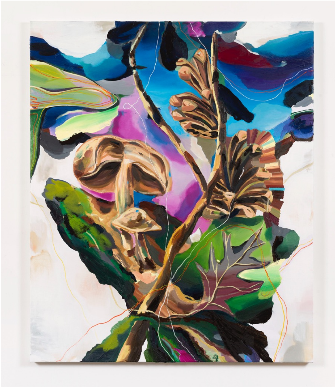
Adam Saks Ravine, 2022 Oil on canvas 71 x 59 in / 180 x 150 cm AS033 $18,000.00