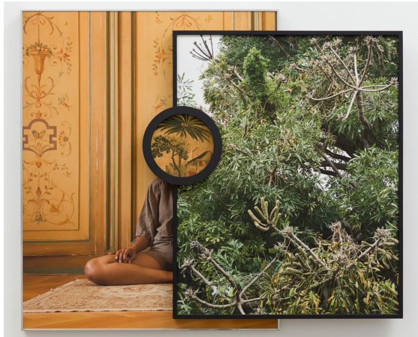
“Samita” by Todd Gray, 2018. (Michael Underwood / Meliksetian Briggs)

of a wall delicately painted with a floral motif. The other half of her body is covered by an almost equally large photograph of African foliage. Her face is obscured (or replaced?) by a smaller, round frame featuring a detail of a European tapestry depicting tropical plants.